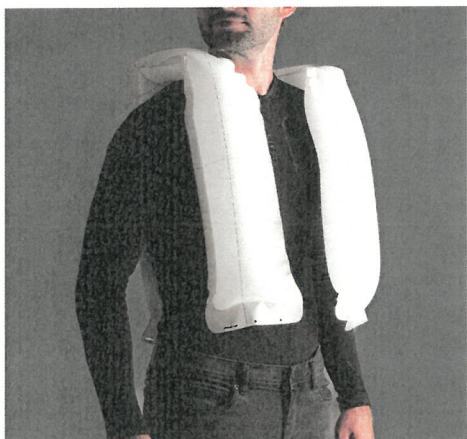
Airbag deployed (front side)